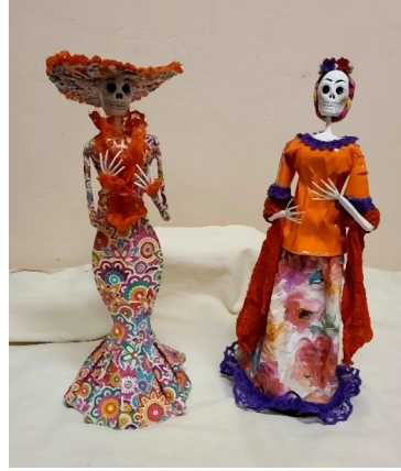
Paper mache Catrina, Catrin and Skeleton Frida. A great item. $22.00