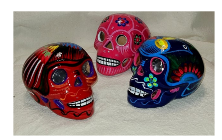
DT-662A Larger Medium $8.00 4.5 x 4 in