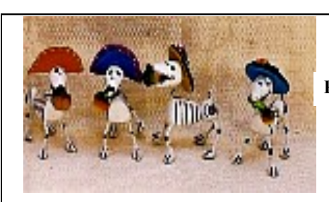
P53 $ 8.00 2 3/4"