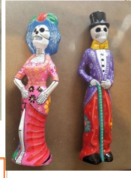
Ceramic Catrina and Catrin figures

@10-11 inches at $10.0 0 @13- inches at $13.0 0