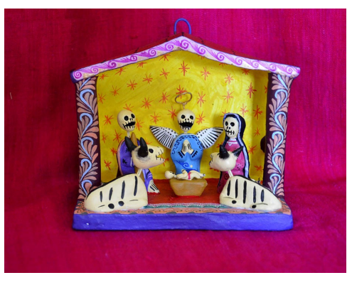
MP-32M $35 5x6"