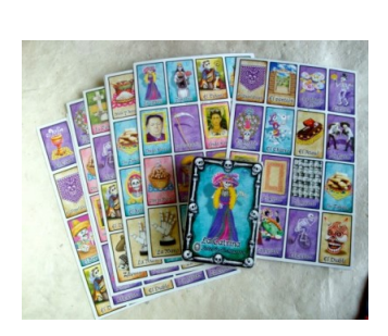
Day of the Dead Loteria $6.50