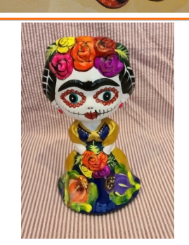
Ceramic Fridita, DOD $16.00 9x5 in

@10-11 inches at $10.0 0 @13- inches at $13.0 0