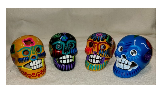
DT 663 Small Ceramic Skull $5.00 2.5 x 3 in Assorted colors

Following the colorful patterns originally created by Otomi communities in Puebla State for amate paper (bark fiber paper), the Nahuatl painted them on ceramic objects. Bright festive scenes, fantastic bird shapes and colorful geometric floral designs became more prevalent.