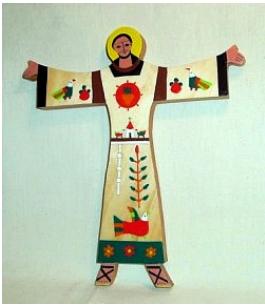
240 St. Francis